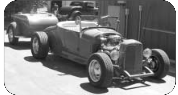
'26 Hiboy on a '32 frame Wescott Body