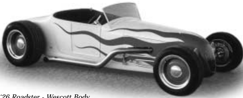
'26 Roadster - Wescott Body Hot Rod Magazine Anniversary Car Built by Roy Brizio